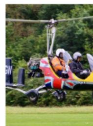
Rotaspot MTD Sport £27,500.00 VIEW LISTING

If you have a gyro or anything gyro related to sell, and you'd like us to advertise it on the website, then please contact: events@britishrotorcraftassociation.co.uk