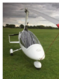
Rotaspot Calidus 914 £49,999.00 VIEW LISTING